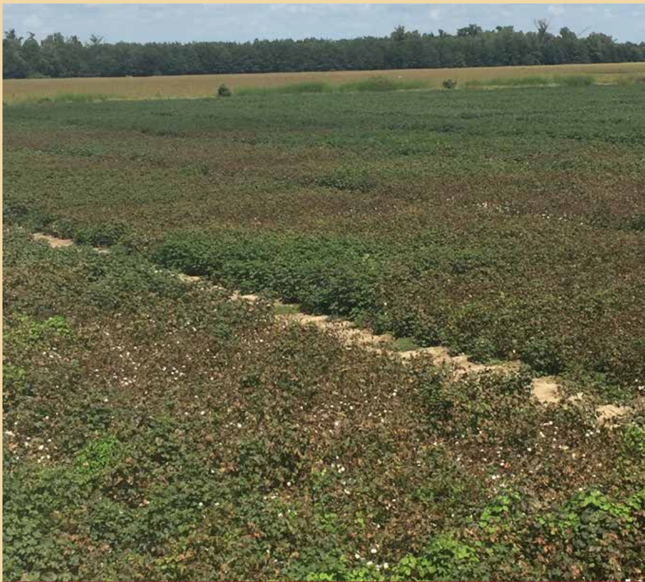
Verticillium wilt in a cotton variety test at the Judd Hill Cooperative Research Station in 2017