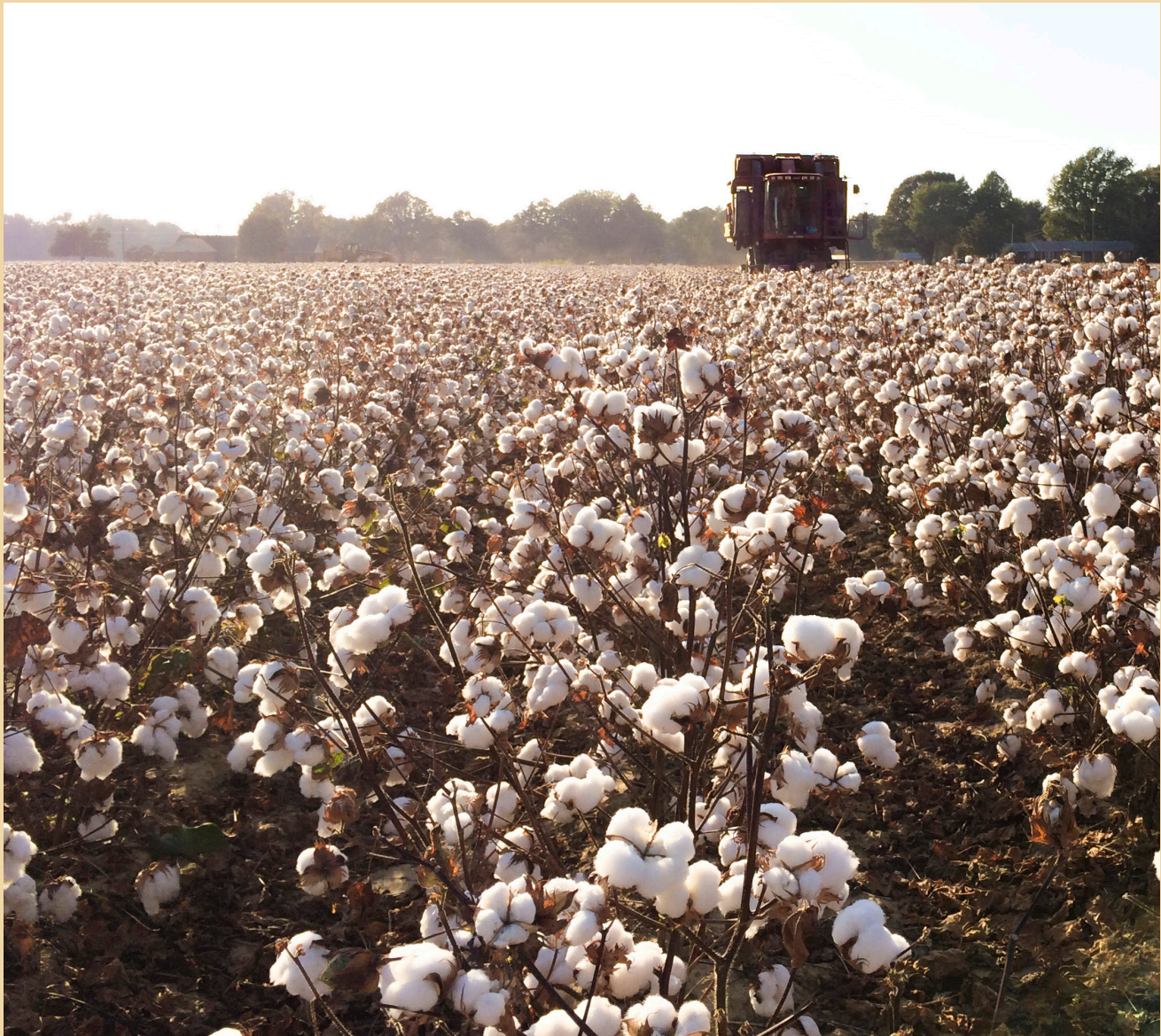
Arkansas Cotton Variety Test 2019 plot at the Lon Mann Cotton Research Station, Marianna